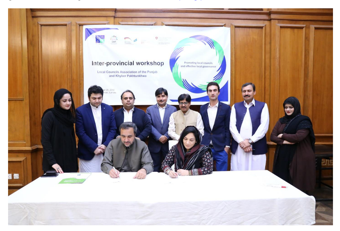
The presidents of LCAs KP and Punjab sign an MoU during the event.

At the end of the meeting, both LCAs signed a memorandum of understanding to work together, exchange knowledge, experiences and best practices to make local governments strong, to find MoU visit <u>www.lcap.org.pk</u>.