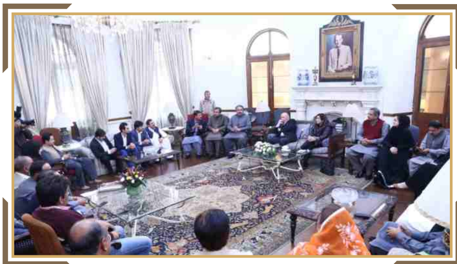
Provincial LCAs meet with the Governor of Punjab in November 2018 as part of the advocacy process to strengthen local government