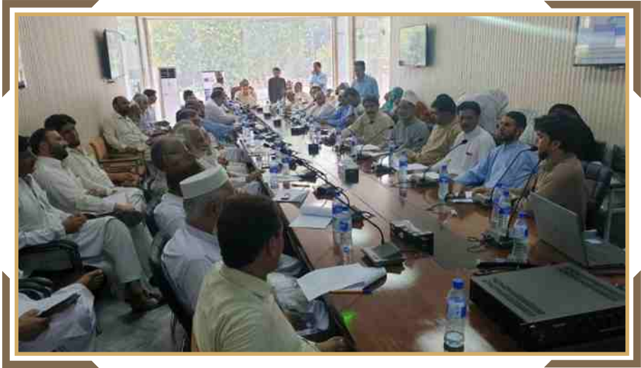
Territorial Approach to Local Development (TALD) seminar in Malakand (PKP province) July 2019